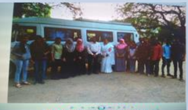
Dept of Zoology Visit to Umadade Tal. Eroudol (2019)