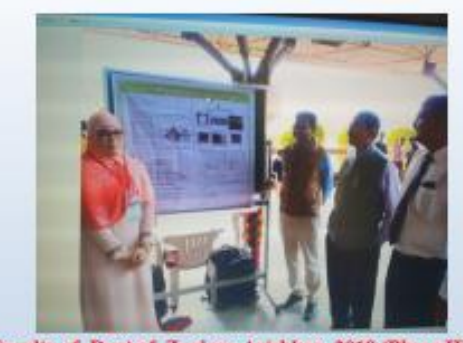
Faculty of Dept of Zoology Avishkar -2019 (Phase II)