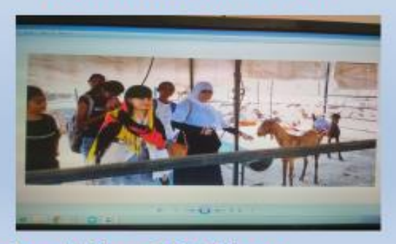
COCC Student visit Goatry farm At. Dhanwad Dist. Jalgaon